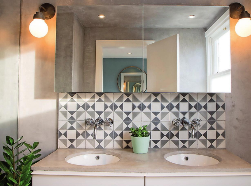
The en-suite bathroom is done in Moroccan tadelakt, and below is the airy, light living room